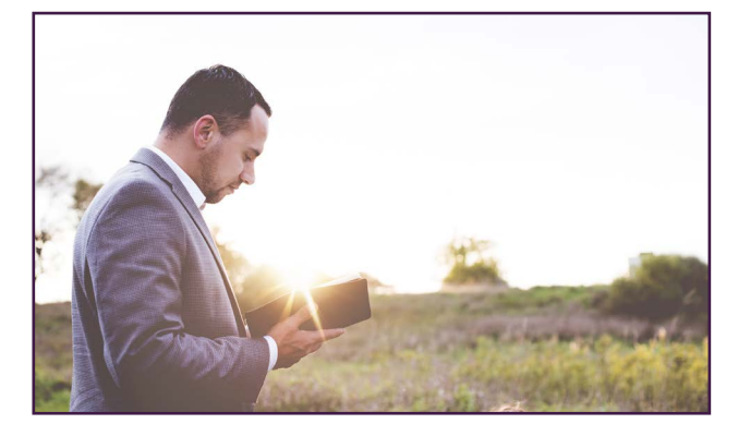
Stewardship Devotional Readings. This collection of real-life stories of ordinary people showcasing God's faithfulness can help strengthen and build faith in Him. Extracted from three books, Ordinaray People-Extraordinary God, Ordinary People—Faithful God and Ordinary People-Generous God.