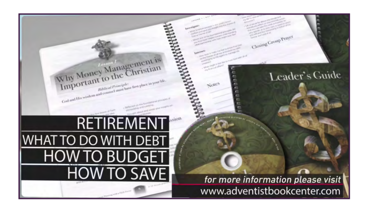
Books—Faith and Finance (Particpant's and Leader's Guide). This is a 12-week personal finance seminar that helps families manage their finances, courtesy of NAD.