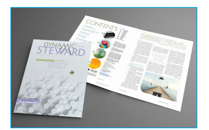
Now in French, Portuguese, and Spanish.